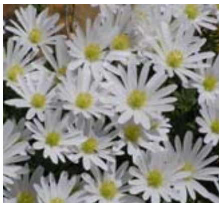
One is a close-up of some Anemone "Blanda". Another is of some Spring bulbs and perennial viola; it looked like a simple and lovely little grouping. Paul Luzetski