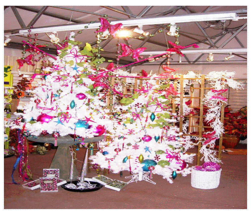
Rustic Tree White Christmas Tree