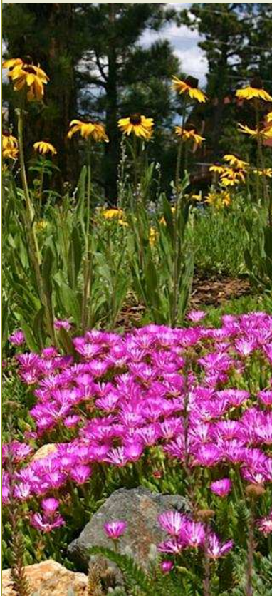
Fire Wise Garden Detail

The goal I had for the FTC garden was to plant flowers that are first of all, low growing (firewise). I wanted the front and side of the garden to include