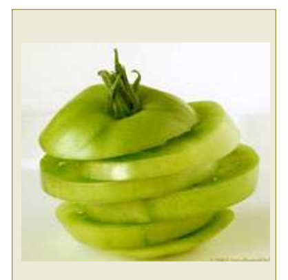
Green Tomato Dilemma