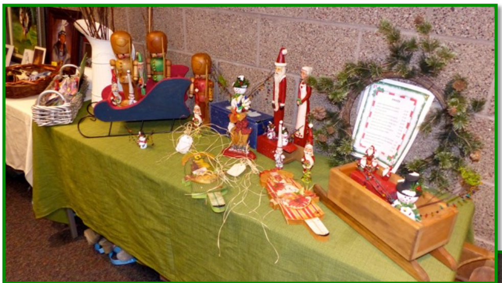
Crafts for sale, handmade by our members.