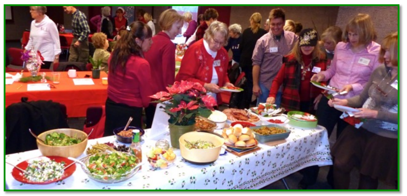
Our excellent Christmas food table.