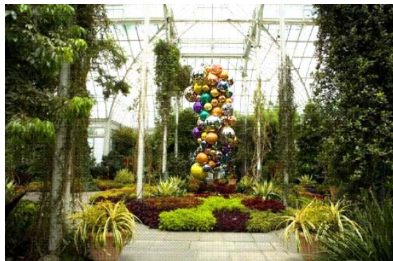
Chandelier in the coleus garden

All of this information on Dale Chihuly I found on the Dale Chihuly web site. If you would like to learn more about this artist, go to http://www.chihuly.com/ and an abundance of information will be at your finger tips.