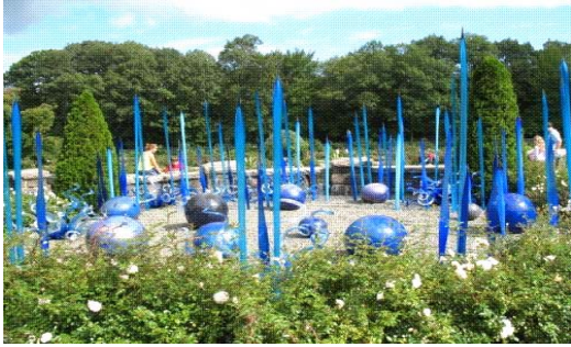
The Rose Garden Fiori

(Continued from Horticulture Chihuly exhibit)