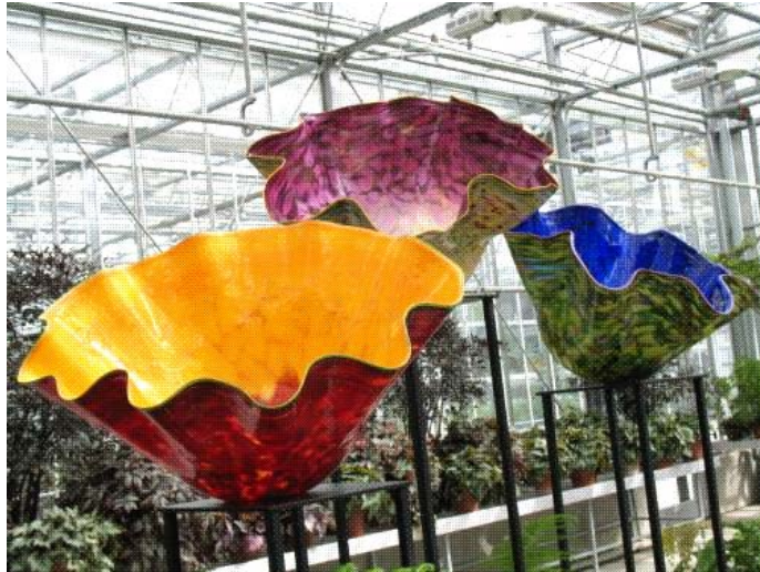
Chandelier above cactus exhibit