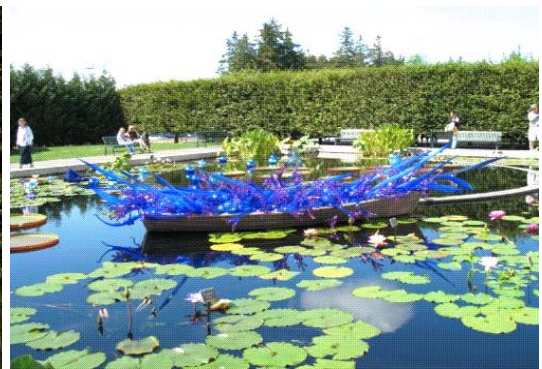
Lily pond with blue boat and Walla Walla in the background