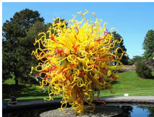
The sun. This installation weighs over 4,600 lbs and has more than 1,000 pieces